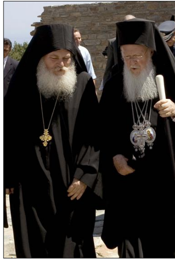
Archimandrite Ephraim and Patriarch Bartholomew

with fellow clergymen, members of the House of Representatives and government officials. Metropolitan Philaret awarded the abbot with the St. Cyril of Turov Order.