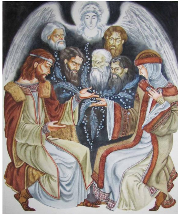
Peter is looking at what Fevronia has in the palm of her hand, while malicious boyars are looking on

Prince Peter decided to see if these accusations were true. He ordered that Princess Fevronia sit beside him at the table. When dinner was over, Fevronia picked up all the crumbs and kept them in her hand as she was accustomed to doing since her childhood. Seeing this, Prince Peter caught her by the hand and told her to open her fist, but when she did so they found fragrant myrrh and incense in the palm of her hand. And from that day on, Peter never attempted to question his wife’s deeds.